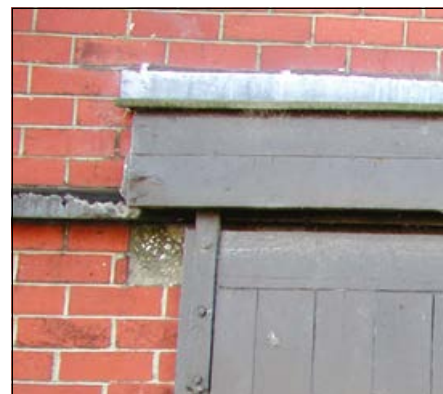
Built-up bituminous roofing and bituminous asbestos fabric over a doorway